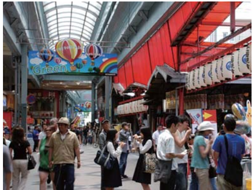
Osu What is Karakuri? What is Shinto? What is Matcha? A Hotch-potch of traditional and pop culture, fashion for the young and the old, Shintoism and Buddhism, and local and international cuisines. You can take a glance at the daily life of locals.