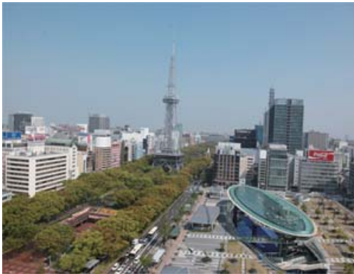
Sakae Have or enjoy your lunch in the downtown Sakae area (Lunch NOT included). Discover Nagoya's delicacy in Nagoya? What is Kaiten-sushi? Enjoy the delicacy in Nagoya and take a picture at OASIS 21 with Nagoya TV Tower in the background.