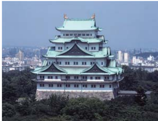
Nagoya Castle Tour starts with visiting No.1 tourist destination of Nagoya castle. Who lives in the castle? What are Samurai? What is Shogun? You will find out all these answers by joining this tour.