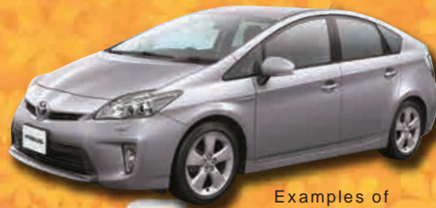
Examples of Rental Cars