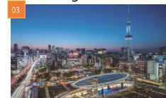
Oasis 21 & Chubu Electric Power MIRAI TOWER / Oasis 21 & 中部電力 MIRAI TOWER ★Light-up spot / 點燈景點