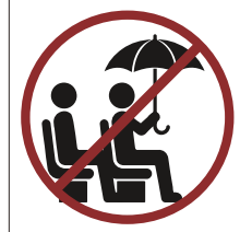
NO Umbrella 禁止在巴士上使用傘