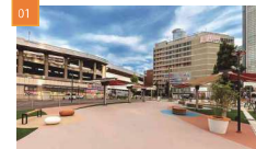
Meieki Parklet (Boarding/乘車)