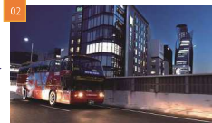
Nagoya Expressway 名古屋高速