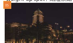
Nagoya City Hall 名古屋市政府 ★Light-up spot / 點燈景點