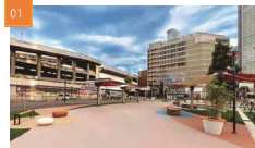
Meieki Parklet (Boarding/乘車)