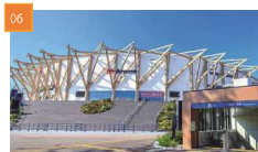
IG Arena / IG 競技場