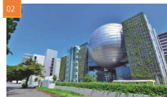
FUJI Nagoya Science Museum 富士名古屋科學博物館