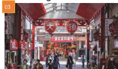
Osaka / 大須