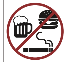
NO Food, alcohol and smoke 飲食飲酒和吸煙 (non-alcoholic beverage with bottle caps are allowed) (可以帶有蓋的瓶裝無酒精飲料)