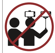
NO Selfie stick 禁止使用自拍桿