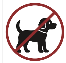
NO Pets 禁止攜帶寵物