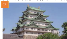
Nagoya Castle (Disbandment OK) / 名古屋城 (解散OK)