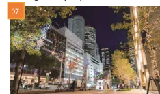
Nagoya Station / 名古屋站前