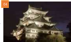
Nagoya Castle / 名古屋城 ★Light-up spot / 點燈景點