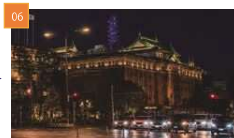
Aichi Prefectural Government 愛知縣政府 ★Light-up spot / 點燈景點