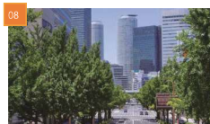
Nagoya Station / 名古屋站前

Night Course (Approximately 85 minutes) 夜間觀光 (約8.5分)