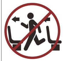
Changing seats or moving 起立或換座