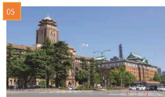
Aichi Prefectural Government & Nagoya City Hall 愛知縣政府&名古屋市政府