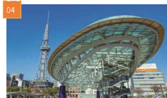
Oasis 21 & Chubu Electric Power MIRAI TOWER / Oasis 21 & 中部電力 MIRAI TOWER